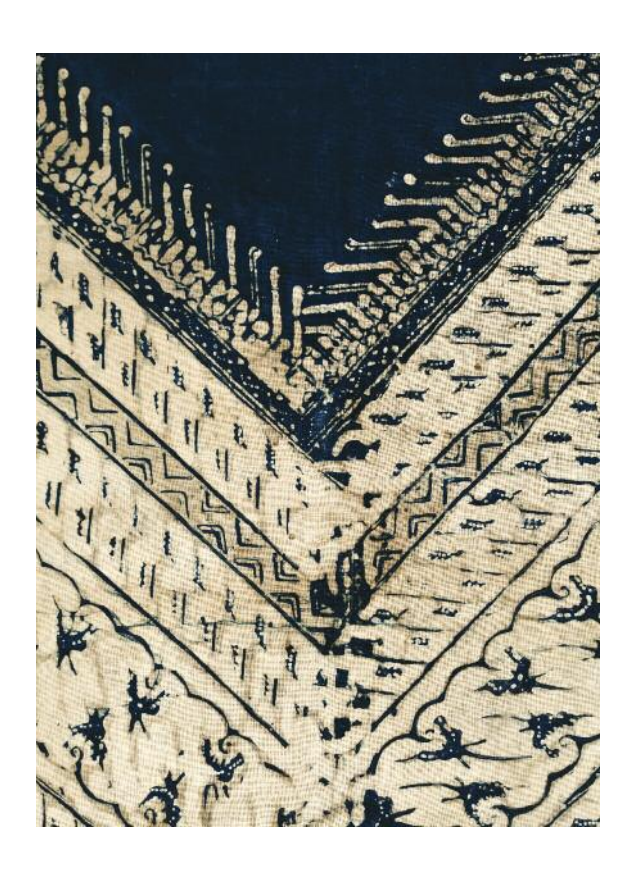
Figure 8 Detail of a headcloth, iket kepala , in which the pattern has been achieved by stamping a pattern in wax before the blue dyebath. Where the wax from two imprints meets there is irregularity and overlap in the design (A27210).