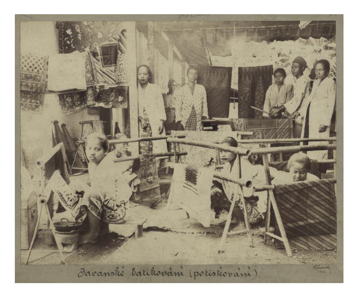
Figure 1 Women at work in a corner of a batik workshop. A wax stove can be seen on the left, and the batiks being waxed are draped over bamboo frames, gawangan. Souvenir photograph bought in Java by Josef Kořenský in 1900.

The woman making the batik fills the canting with hot wax and uses it to cover all those parts of the material that are not to be affected by the first dyeing. To do this she uses cantings with different-sized spouts; for thin lines it is best to use a vessel with a narrow spout, while to cover large surfaces she uses either a canting with a wide spout or she exchanges it for a brush dipped in wax. In order to create several parallel lines, cantings with two or three spouts are used.