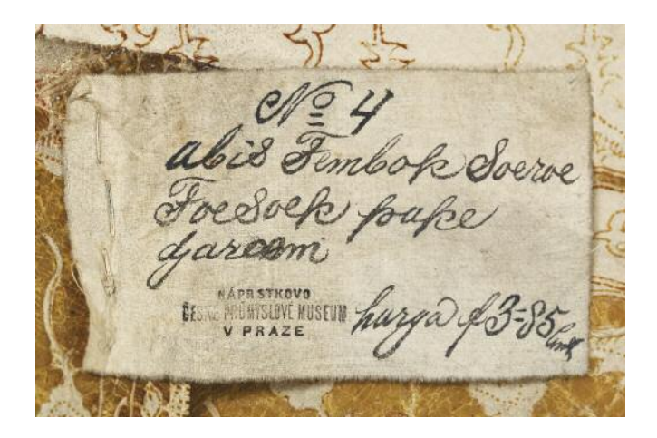
Figure 4 Label indicating that after waxing the background holes are pricked in the wax, which will produce dark dots in the finished work where the dye has penetrated (A 11335).

background has been filled with additional wax so that eventually the pattern will be set against a white ground. A second example (Figure 3) is of a sarung , or skirt cloth, showing both the fine lines of the drawing and the darker parts where the larger areas to be reserved from the dye have been covered with wax. This sample carries a label reading 'No. 4 Abis tembok soeroe Toesoek pake djaroem ', which can be translated as 'After being covered with wax, it is to be pierced with a needle' (Figure 4). This piercing of the wax layer protecting the cloth from the dye would result in dark stipples in the background in the places where the dye had been allowed to penetrate, a technique usually, but not exclusively, associated with Cirebon and Indramayu on the north coast of Java (Abdurahman 1987: 6). The label indicates a price of 3.85 florins.