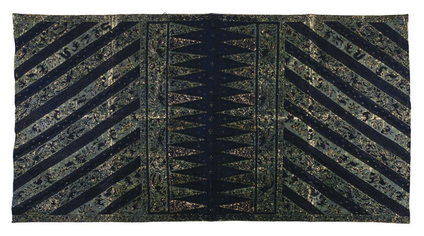
Figure 5 Partly worked batik sarung after the waxing of the design and background and the first immersion, which was in this case in an indigo dyebath. Cracks in the wax show where the cloth has been folded (A 11336).