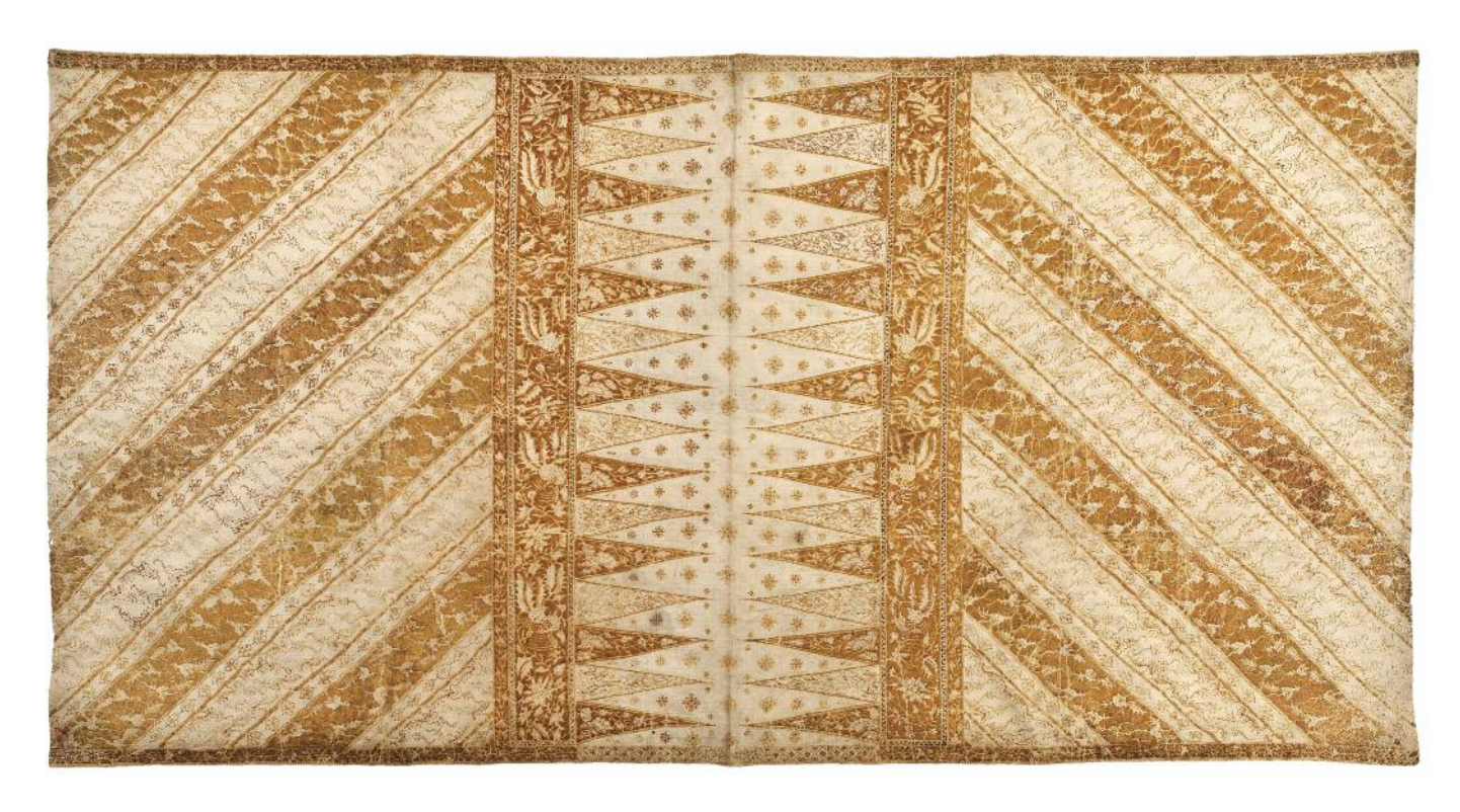
Figure 3 Partly worked batik sarung after the waxing of the design and background. The backgrounds of alternate tumpal triangles in the kepala (head) have been waxed. The badan (body) has a diagonal lereng design (A 11335).