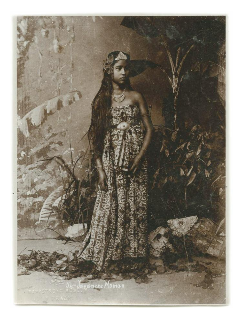
Studio photograph of a young woman from Java, with the handwritten date 1906 on the reverse. She may have been a dancer. Although she is wearing batik, the garment is not typical (Náprstek Museum Library, Collection of Historical Photographs, 183.86).