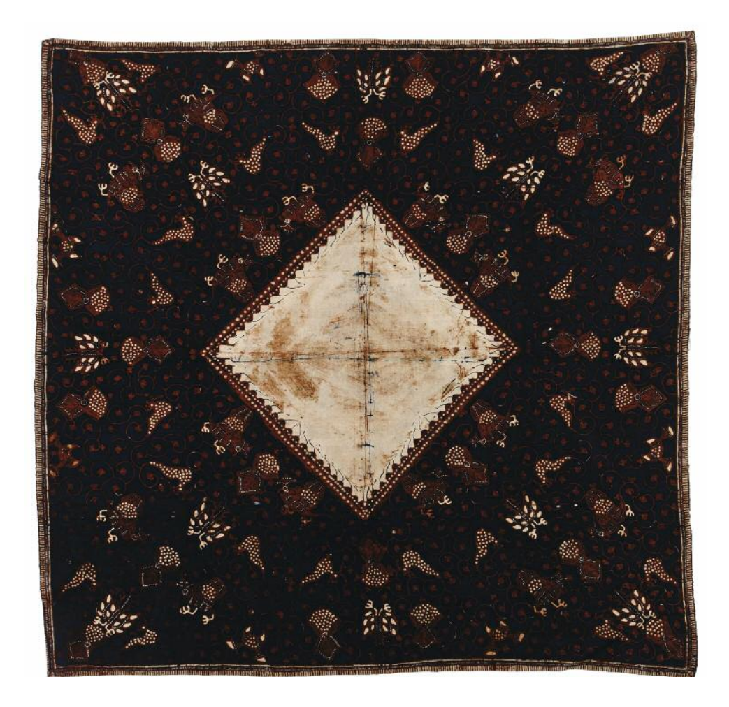
Figure 10 In this man's headcloth, iket kepala, the central square tengahan is placed at an angle to the sides of the cloth. The badan is dominated by soga brown, with motifs of two-footed creatures in the main field and rows of rudimentary cemukiran around the inner edge of the tengahan (A11317).