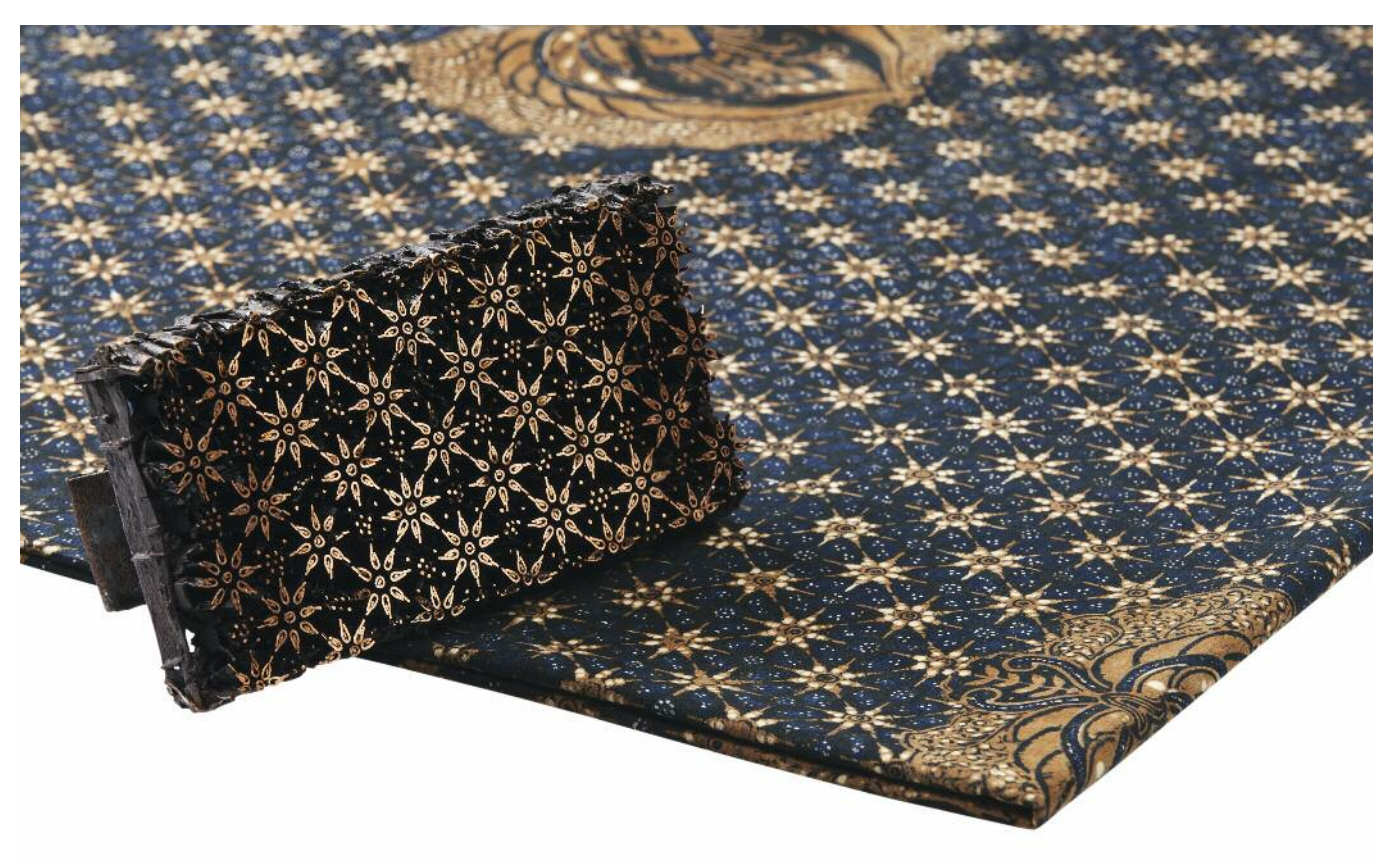
Figure 7 A metal stamp, canting cap, of the truntum design, resting on a cloth with the same stamped design. The wax would have been applied to both faces of the cloth (Private collection).