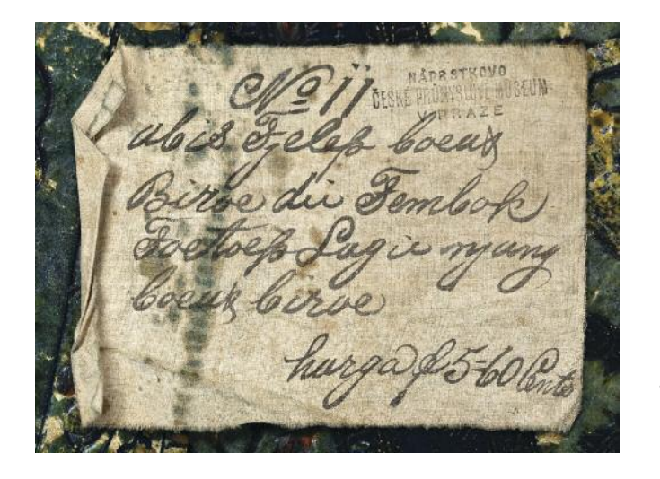
Figure 6 Label indicating that after the indigo dyebath those parts which are to remain blue are covered with wax. The cloth was probably then to be immersed in a brown soga dyebath (A 11336).

A third sample cloth (Figure 5) shows a similar sarung after its first, indigo blue dye bath. The cloth appears to have been folded, probably so that it could be immersed in the dye bath, resulting in cracks in the wax. The attached label reads: 'No 11 abis tjelup boeat biroe di tembok toetoep lagi yang buat biroe' , or 'After the blue dyeing, the parts to be blue are again covered with wax' (Figure 6). The price is 5 florins 60 cents. These three examples probably date from the late 19<sup>th</sup> or very early 20<sup>th</sup> century.