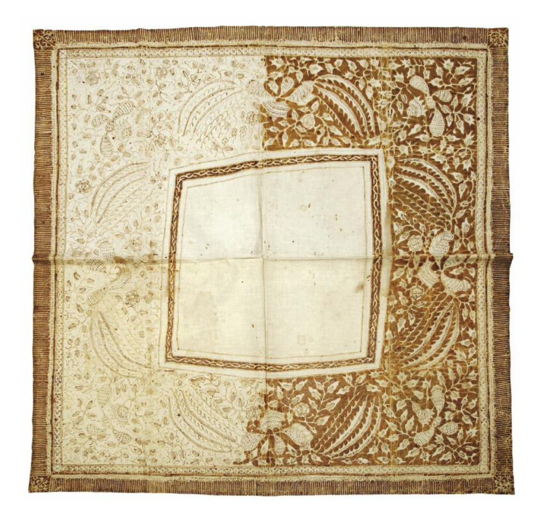
Figure 2 Partly worked batik headcloth, iket kepala, showing the early stages of the process. On the left the fine lines of the pattern have been drawn in wax; on the right the background has next been filled with wax to protect the cloth from the dye (A 11334).

Once the fabric has been covered with wax on both sides, the dyeing takes place. The dominant colour is blue, from indigo, red, from mangkudu (Morinda citrifolia)<sup>1</sup> and brown, from soga (Peltophorum ferrugineum).<sup>2</sup> After the first dyeing, the layer of wax is removed by soaking the fabric in hot water, which reveals the as yet undyed white area of the fabric. This is then subjected in the same way to another dye; by mixing them it is possible to obtain a more complex degree of colouration, so by overlaying indigo on mangkudu a black colour is achieved and so on.<sup>3</sup>